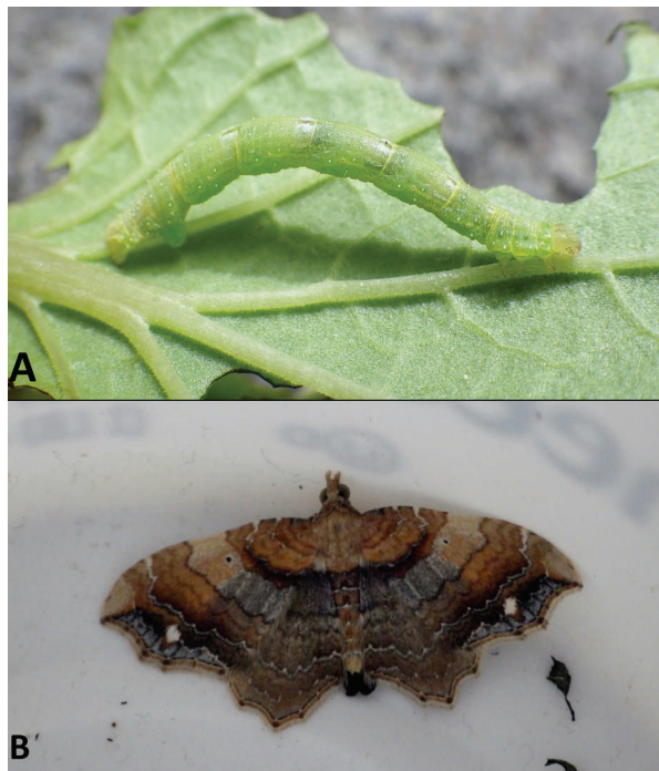
FIG. 3. A. Herreshoffia gracea caterpillar from Gila County Arizona. B. Freshly emerged adult.