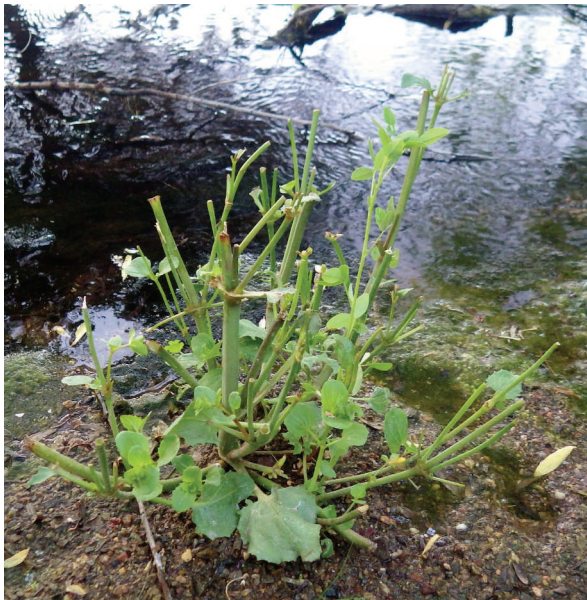
FIG. 2. Damage to Mimulus guttatus from Junonia coenia (Maricopa Co. AZ).

herbivores may use at least some PPGs as feeding stimulants (Holeski et al. 2013). Many plant species within the Scrophulariaceae sensu lato (where Phrymaceae was once included) contain PPGs (Mølgaard & Ravn 1988). This shared phytochemistry leads to many of the same specialist herbivores feeding from plants across the Scrophulariaceae sensu lato (Bowers 1988). Despite its defenses, herbivory on M. guttatus can still be very damaging to plants (Fig. 2).