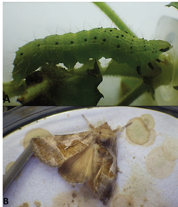
FIG. 4. A. Autographa pasiphaeia caterpillar from Kern county California. B. Freshly emerged adult.